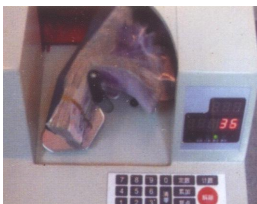
soft banknote low speed