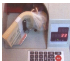
new banknote high speed