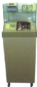
spindle banknote counter + Banknote identifying apparatus