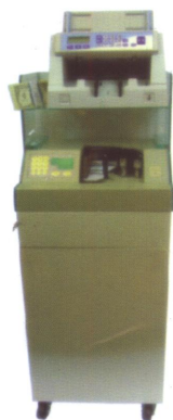
spindle banknote counter + banknote counters