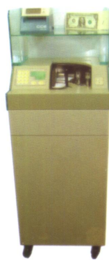
spindle banknote counter + seizing banknote machine

Specification and information contained in this manual furnished for informational use only .and are subject to change at any time without notice and should not be construed as a commitment by us .We assume no responsibility or liability for any errors or inaccuracies that may appear in this manual ,including the product and operation described in it.